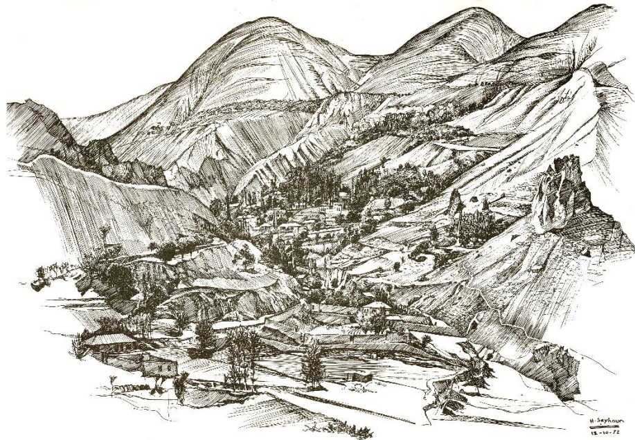
Nias a village near the city of Amol in the northern Iran. This village is isolated during the winter when snows. The location in the mountain, the clean and clear atmosphere, make the village nice and loveable.