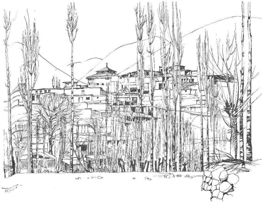
Gheshm. The village is visible through the trees that surrounded the village. It seems that the wood acts as the guardian to protect the village.